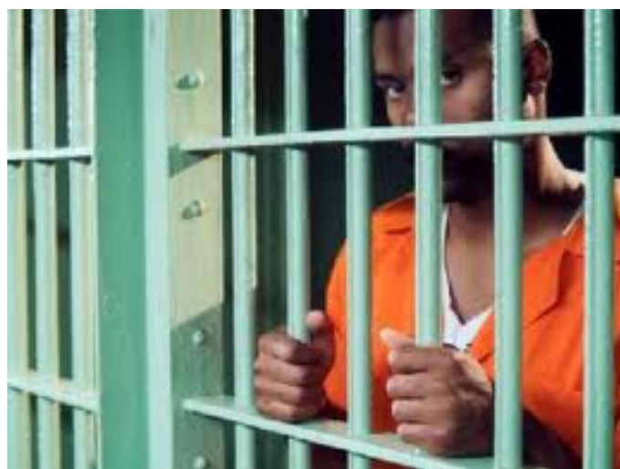
...in Criminal Justice