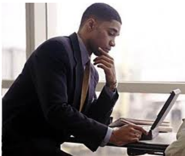
...in Economic Development